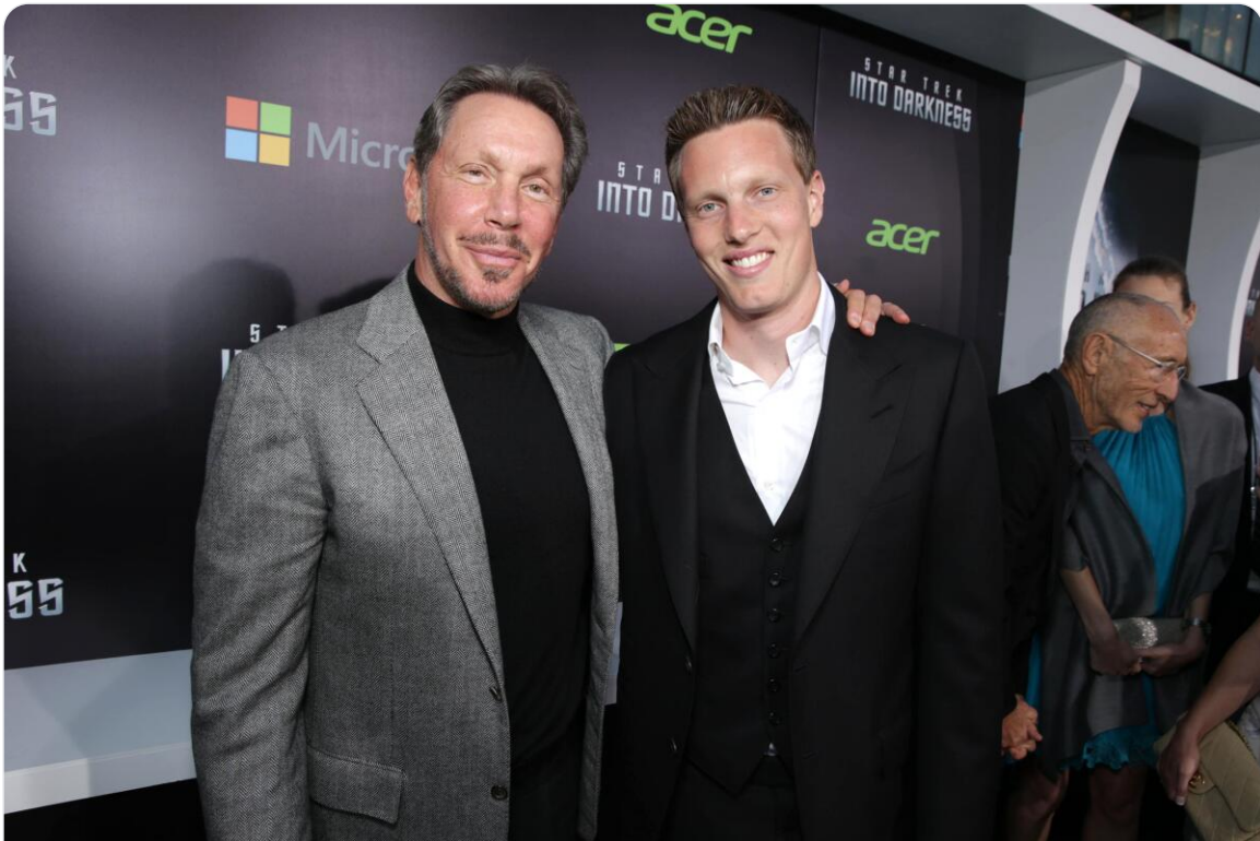
Archival press image: Larry Ellison and family holdings, cited in cross-border financial disclosures.