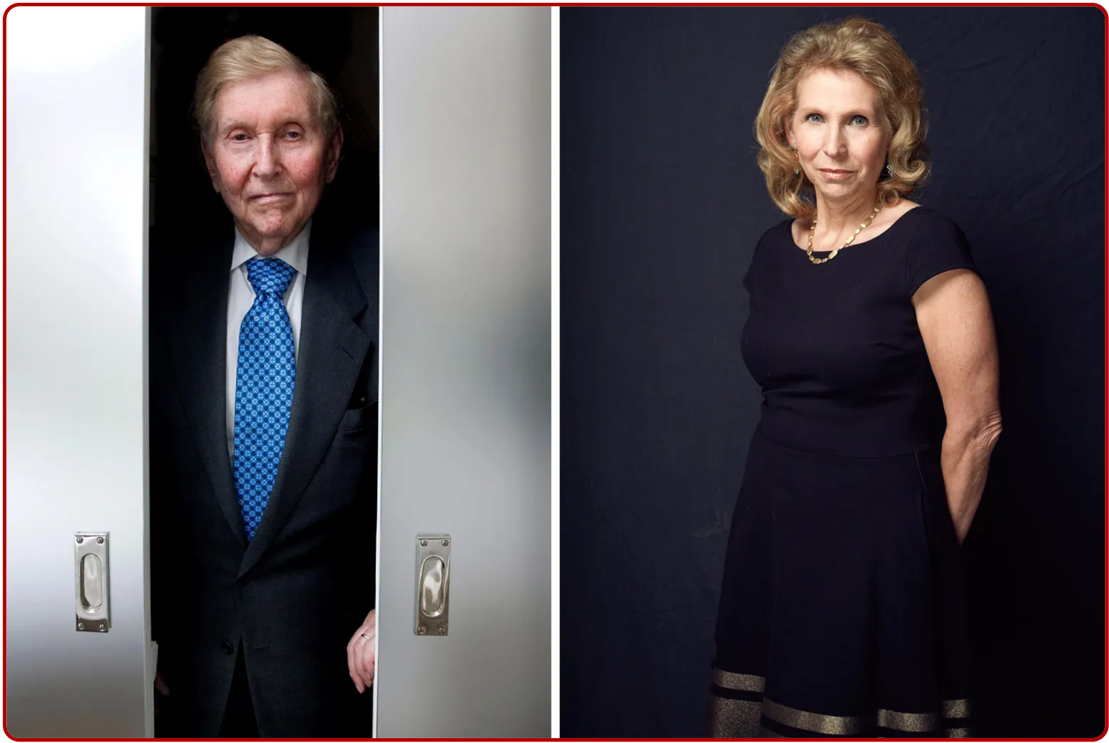
Sumner Redstone and Shari Redstone pictured with journalist Bill Cohan — image referenced in the Court record.

Filed testimony and exhibits describe Sumner Redstone’s Paramount empire as a bridge between Hollywood’s entertainment monopoly and organized?crime financial networks tracing to mid-20th-century operations of Meyer Lansky and Bronfman syndicates. These associations are cited within sworn declarations now entered into the Court record, identifying cross border money movements and legacy corporate structures allegedly extending influence into Viacom, CBS, and affiliated holdings.