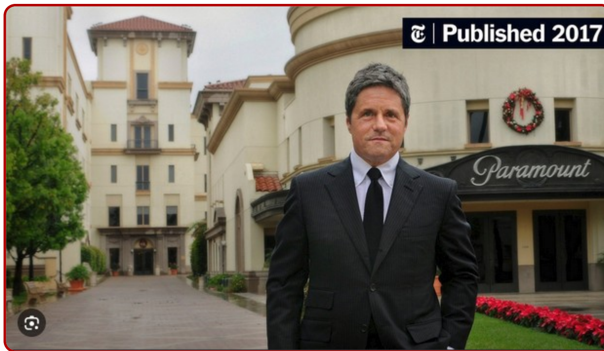
Brad Grey — former Paramount CEO and longtime associate of Sumner Redstone and Harvey Weinstein.