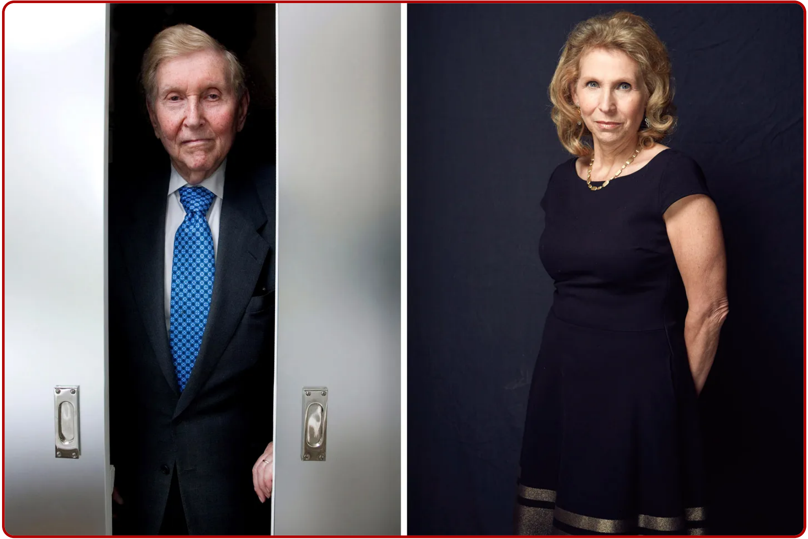
Sumner Redstone and Shari Redstone pictured with journalist Bill Cohan — image referenced in the Court record.

Filed testimony and exhibits describe Sumner Redstone’s Paramount empire as a bridge between Hollywood’s entertainment monopoly and organized?crime financial networks tracing to mid-20th-century operations of Meyer Lansky and Bronfman syndicates. These associations are cited within sworn declarations now entered into the Court record, identifying cross border money movements and legacy corporate structures allegedly extending influence into Viacom, CBS, and affiliated holdings.